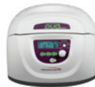
Choukroun DUO Quattro centrifuge setup for i-PRF™ and A-PRF™