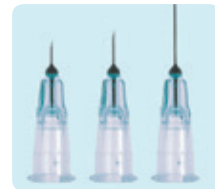
Microinjection needles from 32G - 4 mm to 13 mm