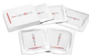
GENOSYS Peptide gel masks