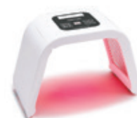
GENOSYS Low Level LED Light therapy