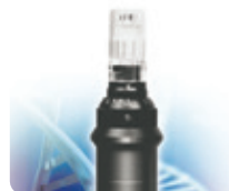
GENOSYS Derafix pen with 16 - 36 micro needles for mesotherapy